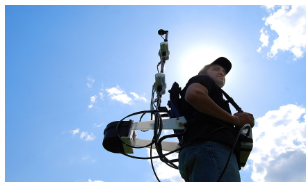
Walking Gradiometer with VLF-EM and GPS

The firmware provides the convenience of upgrades over the Internet via the GEMLink software. The benefit is that instrumentation can be enhanced with the latest technology without returning the system to GEM resulting in both timely implementation of updates and reduced shipping / servicing costs.